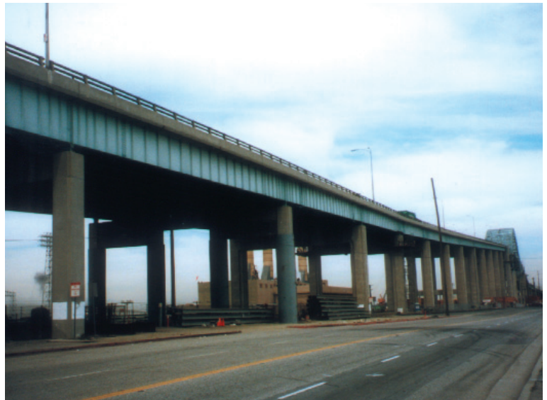
Viscous dampers are providing more and more solutions in retrofitting structures such as bridges.

ITT Enidine Inc. has many years of experience designing energy absorption products for large moving masses in the steel, lumber and off-shore drilling markets. The use of shock absorbers and viscous dampers for seismic applications on bridges and buildings is a new market for ITT Enidine Inc. The engineers who design these civil structures are now beginning to utilize shock absorbers and viscous dampers as solutions for the violent motions caused by earthquakes.