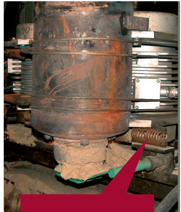
4.2 and 2 Core Line Isolators

In preparation for the casting operation of engine blocks, sand is loaded into a mixer and mixed into the desired consistency. The mixers are typically located on the second or third floor of the plant and often times the mixing procedure would send vibrations through the floor to the lower levels. To prevent this disturbance, the mixers were isolated using spring isolators. This solution did not provide the isolation required. The customer then used the elastomeric (rubber) isolators that were provided by the mixer manufacturer, but they wore out often and had to be replaced monthly. ITT Enidine Inc. suggested installing WRI because the steel cabled isolators would last much longer than the elastomeric isolators. After fine-tuning the WRI in the application, the maintenance required to change the elastomeric isolators was reduced from every 2-3 weeks to minimal maintenance in over 9 months.